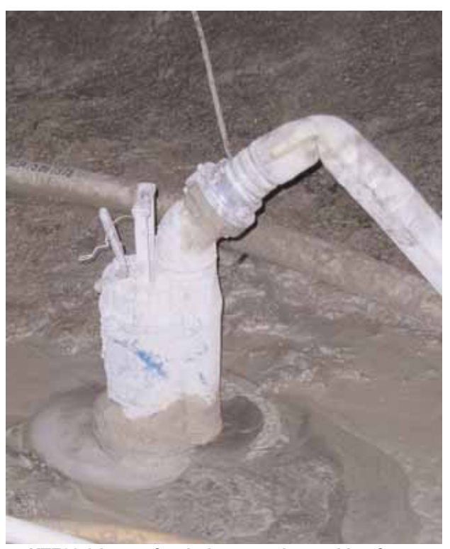
KTZ32.2 in use for drainage at the working face

Drainage during the earth tunnel heading with the aid of submersible pumps.